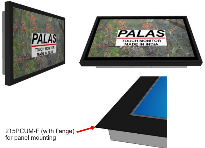
215PCUM-F (with flange) for panel mounting

Unique metal frame PCs for use in harsh environments. Rugged design. Easy mounting through VESA mounts. Anti-reflective.